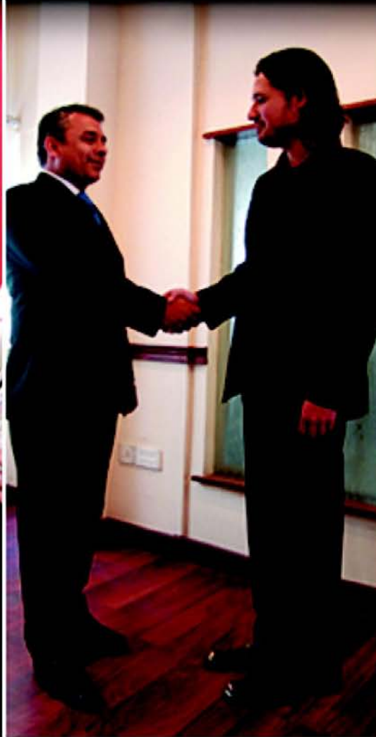
Business in Islamabad