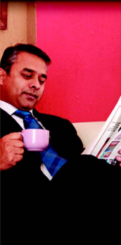
Breakfast in Karachi